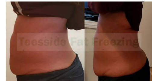
Unretouched photo showing before and six weeks after a single treatment (results vary).