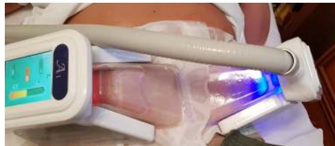
Lower abdomen during bilateral (2 area) treatment

The results are visible. You can see the benefits, usually between about 6 – 12 weeks after treatment. Areas can be retreated for further enhancements. Most people are happy with between 1 and 3 procedures.